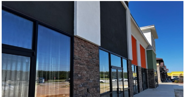
BUILDING 1 | EXTERIOR