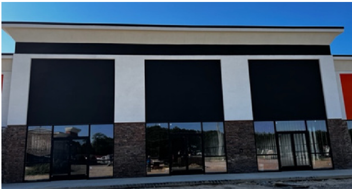
BUILDING 1 | EXTERIOR