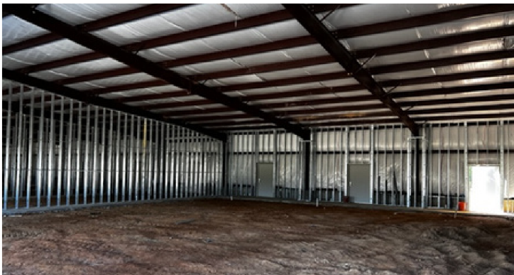
BUILDING 1 | INTERIOR