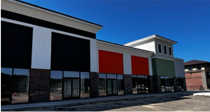
BUILDING 1 | EXTERIOR