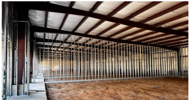
BUILDING 1 | INTERIOR

GEORGE MANLEY NC BROKER C: 910.603.8395 GEORGE@CSGNC.COM