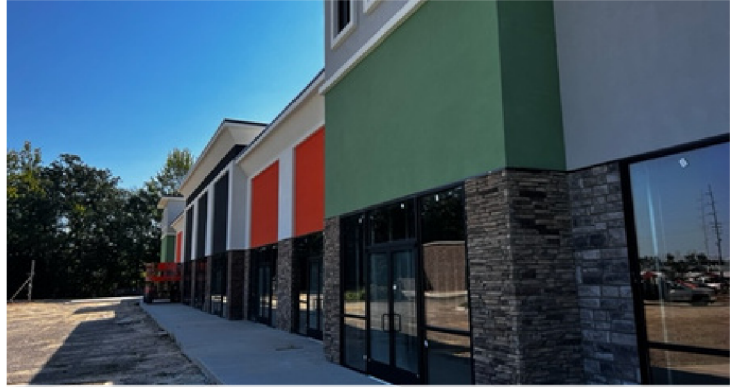
BUILDING 1 | EXTERIOR